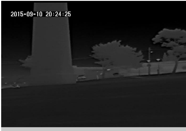
Person visible through gate approx. 135m