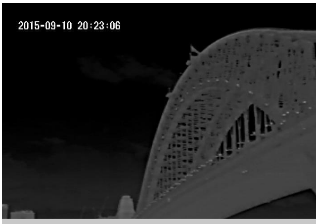
Harbour Bridge at approx. 450m