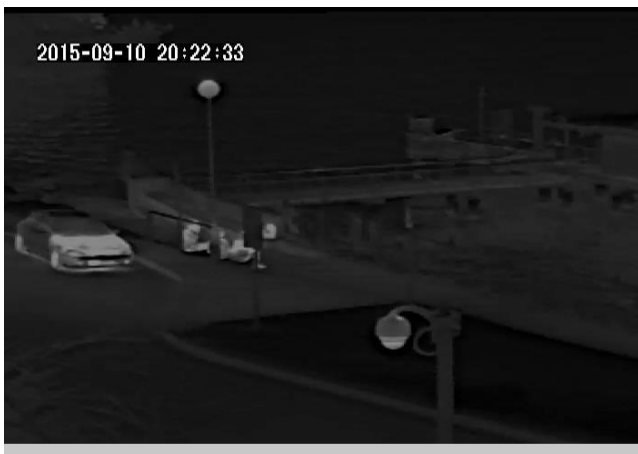
People at Ferry station approx. 60m