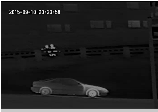
People on seat with car in foreground approx. 40m

All images below were captured from Bradfield Park at Kirribilli at various ranges to showcase what is visible at different detection ranges.