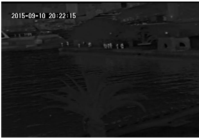
People walking at the point approx. 185m